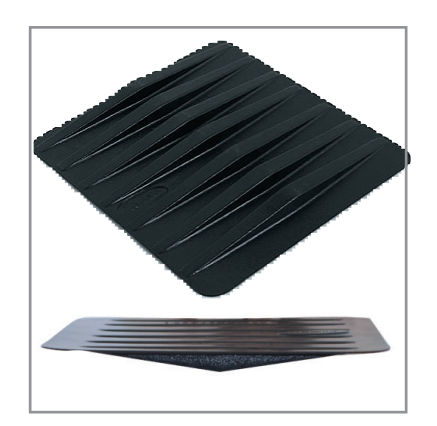
Cushion Rigidizer – lightweight and low profile