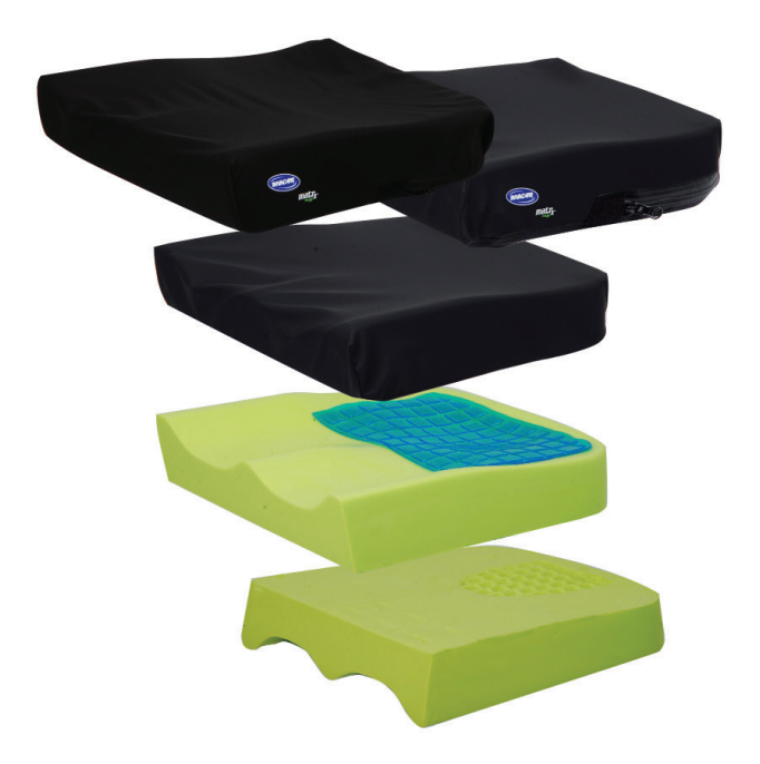
HCPCS Code: Pediatric/Standard - E2607 Heavy-Duty - Pending (E2608)