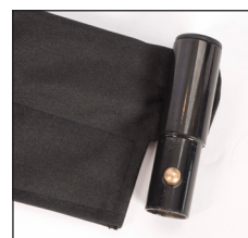
2" Seat extension