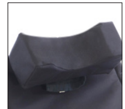
Headrest supports patient when in the reclined position