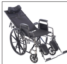
Reclines from 90° - 180°