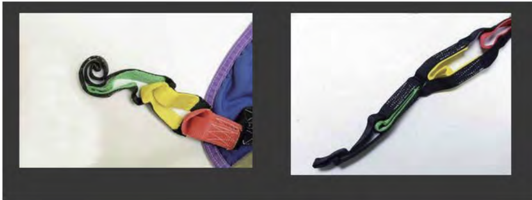
Extreme Loop Strap Curling

Extreme Curling / Permanent Wrinkles of loop straps can set in when the slings are dried at high heat or dried over an extended period of time. Heat combined with bleach or other chemicals will intensify the chemical action.