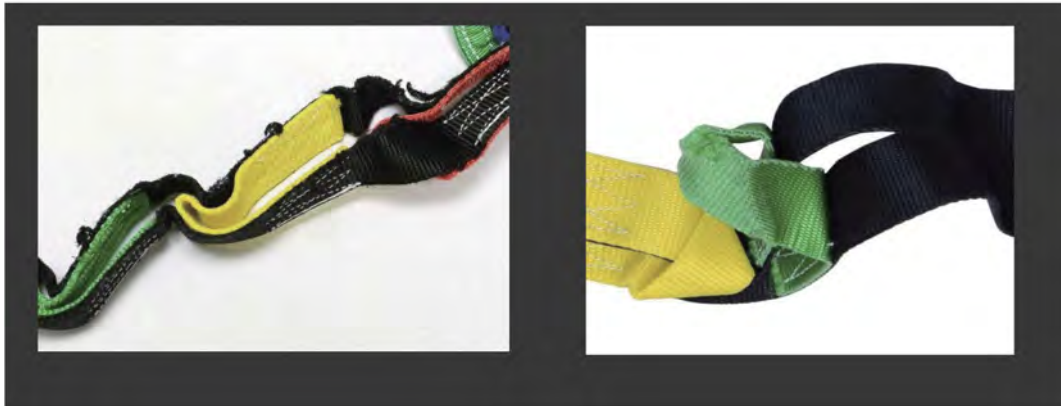
Loop Strap with Excessive Edge Abrasion

Strap Brittleness / Stiffness / Surface and Edge Abrasion are additional indicators that the sling may have been laundered in unsuitable conditions and has lost tensile strength. Loop straps that have stiffened or become brittle will tend to remain in the state, position, or shape it is bent into instead of returning into a normal relaxed state.