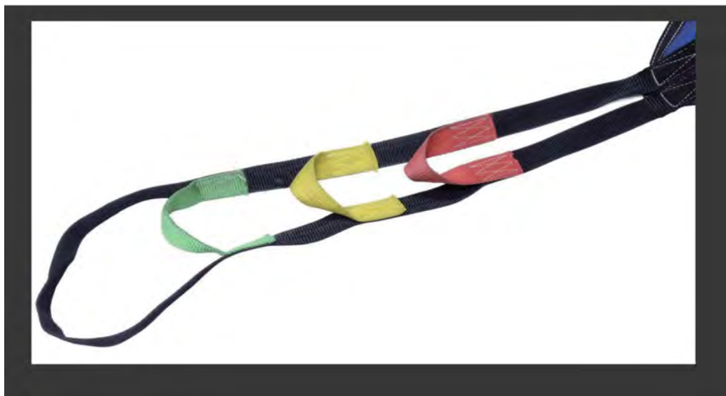
Figure 2 Loop Strap with Normal Wear

Figure 2 shows an example of a loop strap with wear from normal use. Note the absence of permanent crease and surface abrasion.